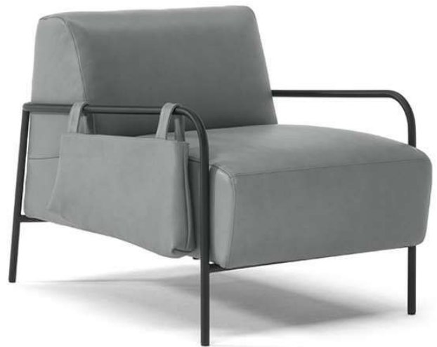
■ Vers. 031+127