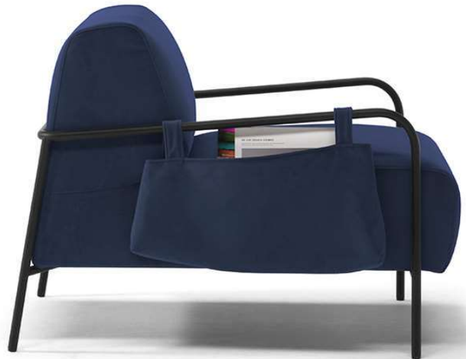
■ Vers. 031+127