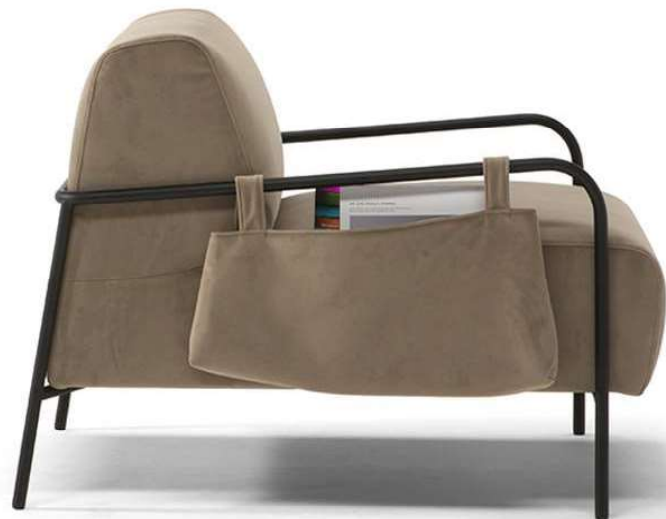
■ Vers. 031+127